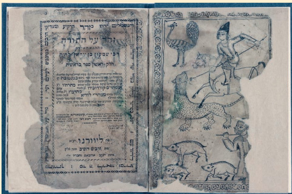
A Zohar from 1815—a central text of kabbalah (Jewish mysticism), with a hand-drawn page.

The Center for Jewish History hired a conservator and conservation technician to work under the direction of the National Archives at College Park, MD. They unpacked the trunks, assessed and documented the condition of each item, and housed the books and documents in acid-free paper and boxes to provide improved support and storage. Due