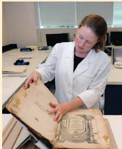
A conservator inspects a volume at the National Archives.