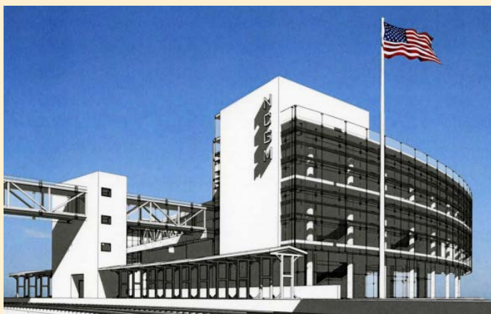
An artist's conception of the new National Museum of the Coast Guard in New London, Connecticut, to be completed in 2017.