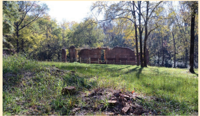
View of the Scull Shoals warehouse (background) and Superintendent's House ruins.

To further enrich forest history programs, HSG produces interpretive plans for Forest Service historic properties, a management tool that is not generally used within the agency. Last year, HSG completed an interpretive plan for the Scull Shoals Historic Area, a historic ruin off the Oconee River on the Oconee National Forest, Georgia. Scull Shoals is a significant historic landscape that showcases several intersections of Georgia history. First occupied by native peoples, Scull Shoals served as a village for early settlement of Greene County (1786); housed numerous mills including Georgia's first paper mill; developed into a plantation and grew to a town and community of slaves, tenant farmers, prisoners, and landowners; and returned to forest with resettlement and the creation of a national forest. Today the site is comprised of foundational ruins of the prior village, plantation, and town as well as