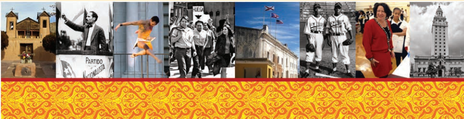
Graphics from American Latinos and the Making of the United States: A Theme Study